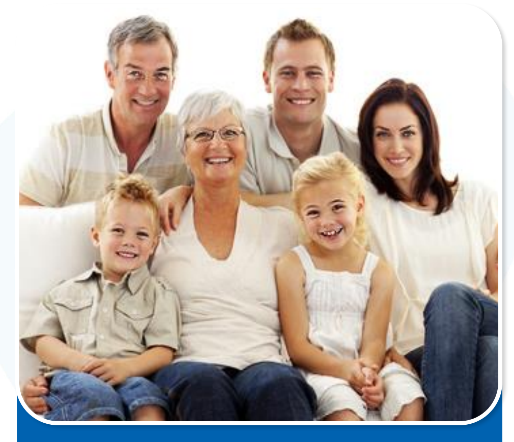
We believe home environment and family support have strong influence on pacient mental health and effects treatment positively.

Our intention is to help people in need and who cannot afford it themselves.